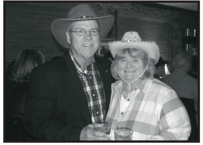
The Websters Back in the Saddle